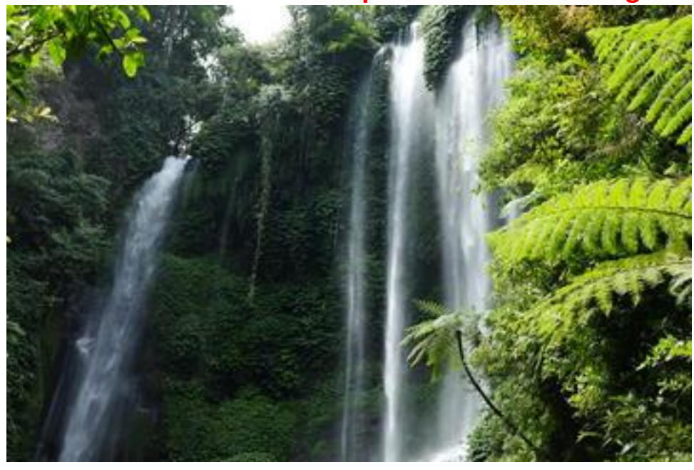
Bali Vulkanen en Sekumpul Waterval Trekking

Waterfall from Kuta/Ubud. First, gaze at the smoking summit of the Kintamani Volcano and capture photographs of the famous Tegalalang Rice Terrace. Then, alongside your guide, you'll embark on a moderately challenging hike — be rewarded with stunning vistas of surrounding valleys as you inhale the aromas of clove and cocoa trees. On arrival at the Sekumpul Waterfall, revitalize with fresh water and then conclude your tour at Pura Ulun Danu Batan, a majestic Hindu temple. Private full-day trekking tour to the Sekumpul Waterfall from Kuta Admire natural landmarks like the Kintamani Volcano and the Tegalalang Rice Terrace Revitalize in the fresh waters of the Sekumpi Waterfall after a moderate hike Visit majestic Hindu temple, Pura Ulun Danu Bratan Receive undivided attention from a private guide. Duurt +-9 uur