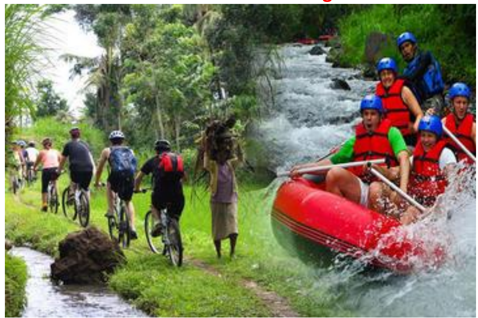
Downhill Mountainbike en Rafting Combi ticket

This tour is combination of ayung river rafting adventure and downhill bike tour. After having lunch, you will be taken directly to the starting point of bike ride in a small village near Kintamani. Duurt +- 8 uur