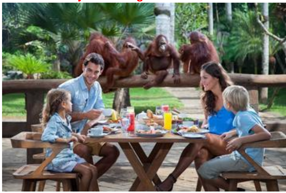
Ontbijt met orang oetans in Bali Zoo

Treat the family—or a loved one—to breakfast with a difference: orangutans! Savor a delicious breakfast at the restaurant in Bali Zoo as these ginger kings of the jungle frolic, play, and feast on their own breakfast. Tour includes zoo admission and door-to-door round-trip transportation from selected Bali hotels. Get up close and personal with the kings of the jungle—orangutans Savor a full breakfast with coffee or tea as you watch wildlife at play Perfect for families—and animal-lovers of all ages Tour includes door-to-door round-trip transportation from Bali hotels. Duur 5 uur