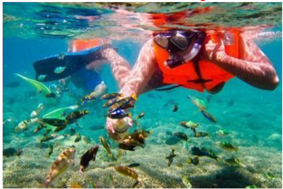
Bali Snorkelen in de Blue Lagoon

Bloo Lagoon Snorkeling – you looking for a great spot for snorkeling in Bali? There are several spots which can offer that to you, but we highly recommend you to go to Bloo Lagoon. This is one of the best spots among the tourists. Let us tell you what you can enjoy from Bloo Lagoon Snorkeling. Duurt +- 7 uur