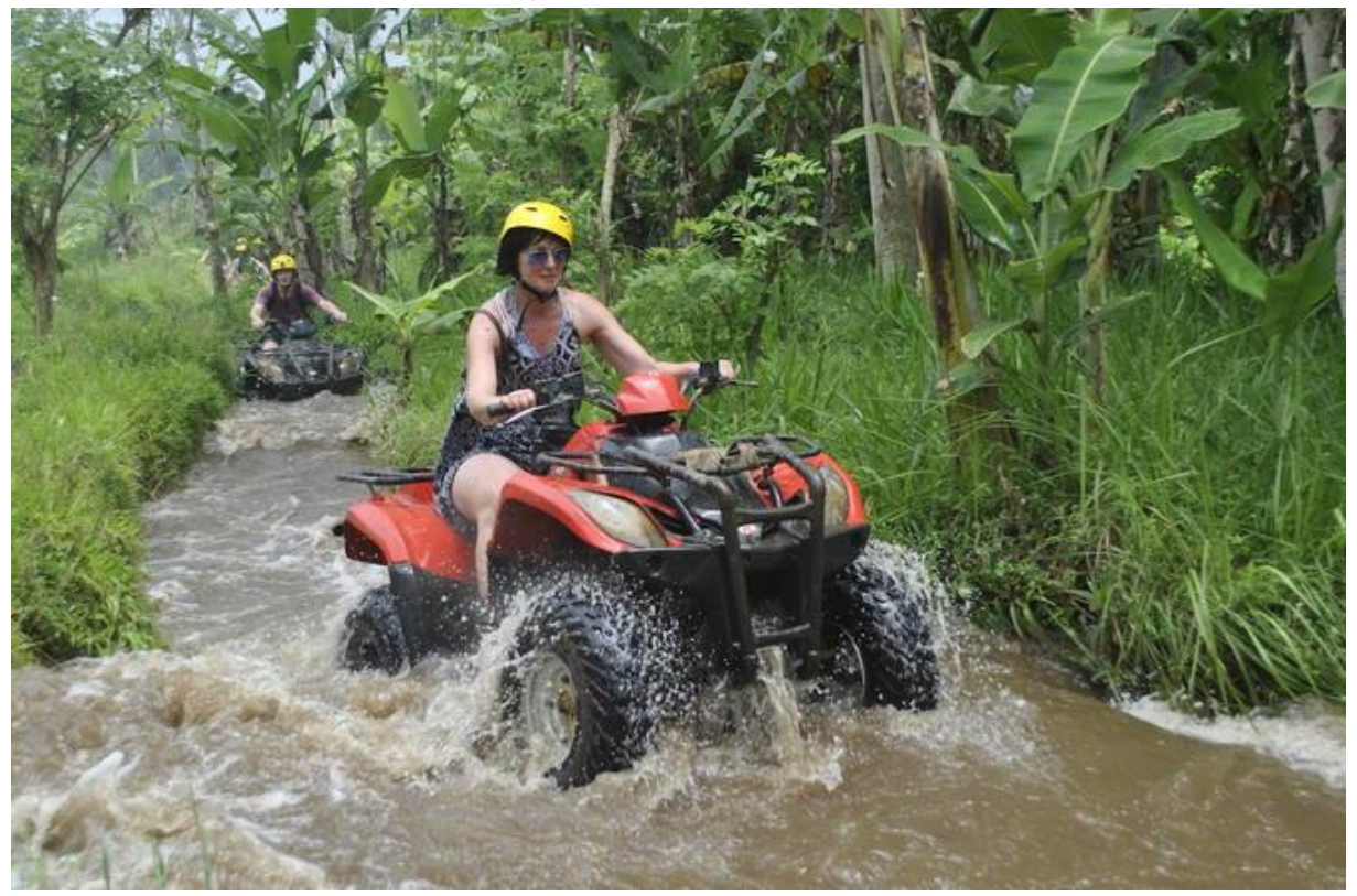
Bali Quad Bike Adventure

Ride off the beaten track during your Bali vacation aboard your own all-terrain vehicle (ATV). Climb onto a quad bike and follow an experienced guide along a challenging track, suitable for all skill levels. Motor past a picturesque landscape of rice fields, bamboo forest and lush riverside flanked by traditional Balinese villages. Showers, lunch, refreshments and round-trip hotel transport included. Bali ATV adventure Ride a quad bike on a 2-hour guided tour Enjoy lunch and refresh with a shower Hotel pickup and drop-off included from Ubud and South Bali. Duurt +- 2 uur